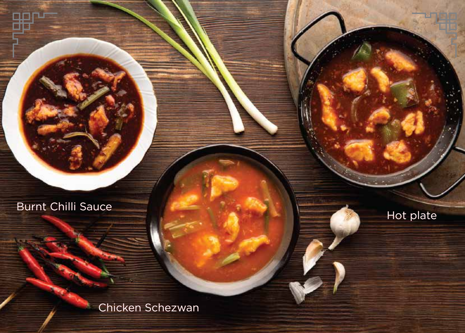
Burnt Chilli Sauce