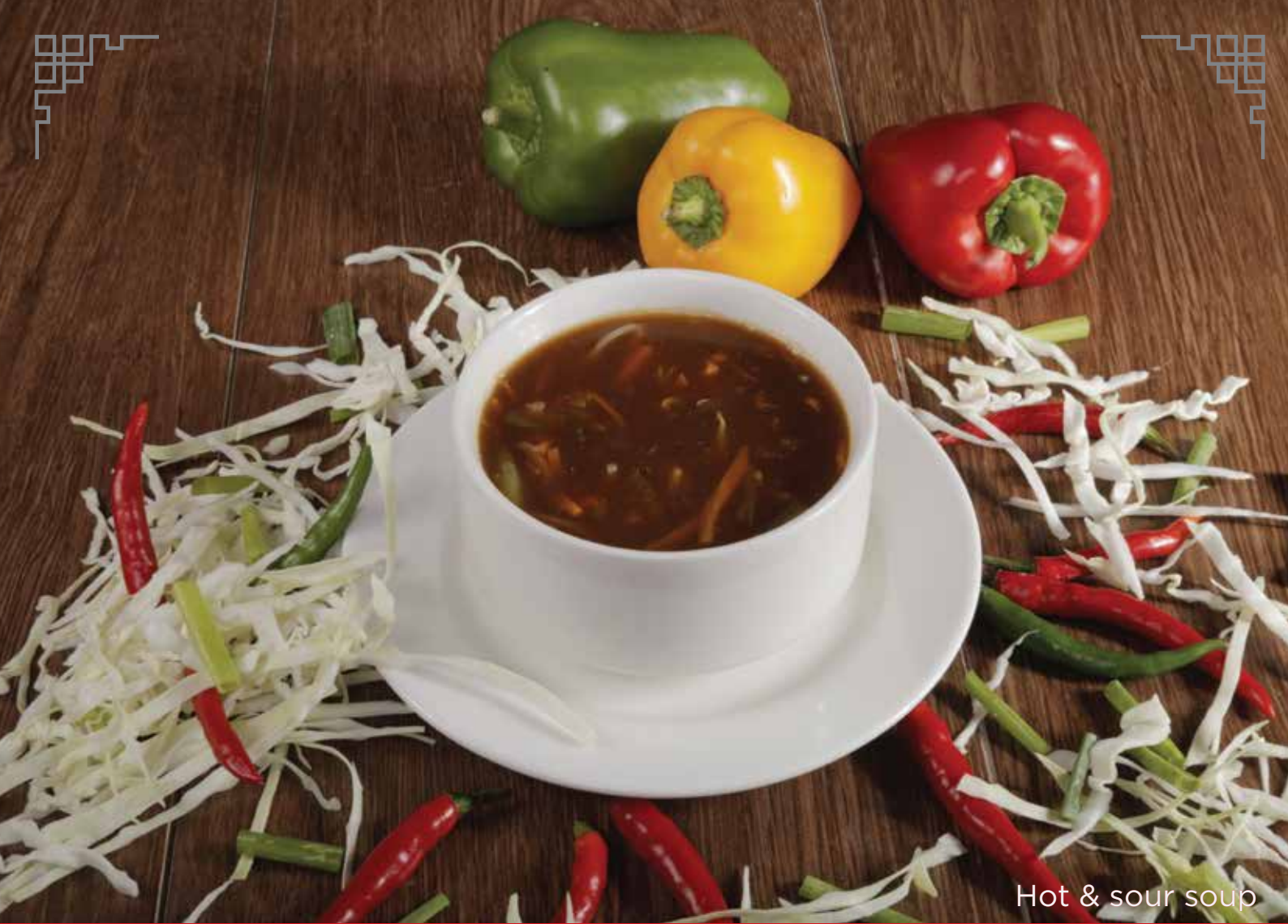
Hot & sour soup