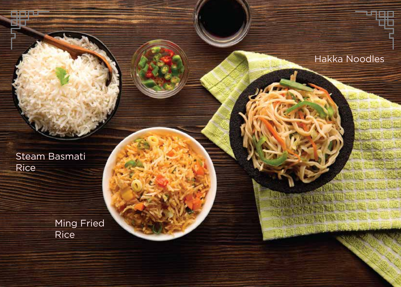
Steam Basmati Rice